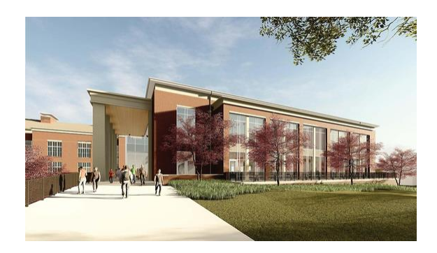
A rendering of the new Central Dining Hall.

This spring, Auburn is set to start construction on a 48,000-square-foot, three-story dining hall. This dining hall, which is set to be completed in the fall of 2020, is being built in conjunction with a 151,000- square-foot academic classroom and laboratory complex, or ACLC. The $26 million dining hall facility will include 800 seats, six food stations, two commercial dining venues and four meeting spaces. The