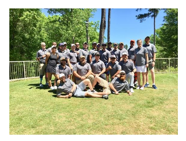
Student Veterans pose at the Veterans Golf Classic.

The Veterans Resource Center hosted its 3rd annual Veterans Golf Classic at the Auburn University Club on April 16.